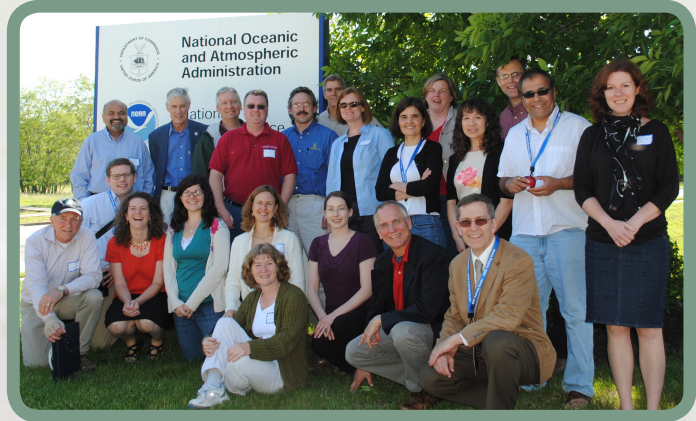
The U2U Project Team