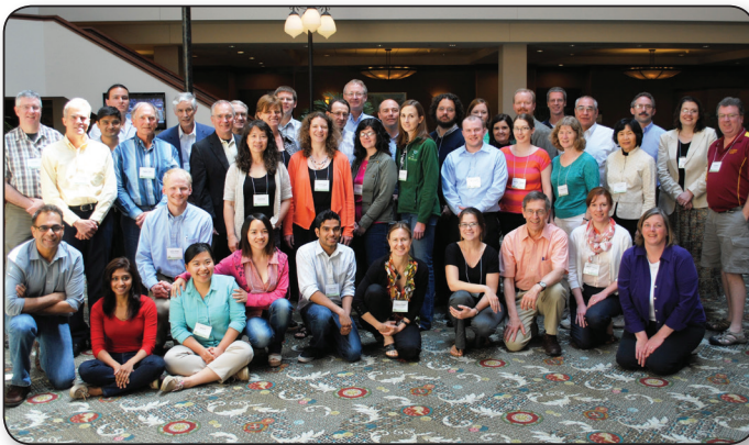
The U2U Project Team

HUBzero™ technology serves as the supporting middle-ware that integrates tasks across all objectives. It will facilitate the development and delivery of decision support tools, climate and adaptation information, and associated materials.